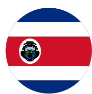
Republic of Costa Rica