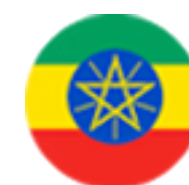
Federal Democratic Republic of Ethiopia