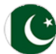
Republic of Pakistan