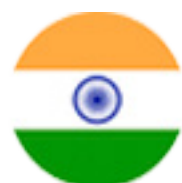
Republic of India